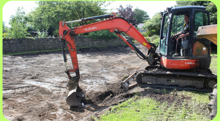
Later that day...