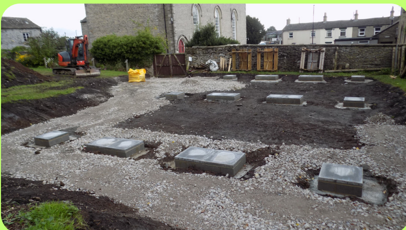
Pads in place