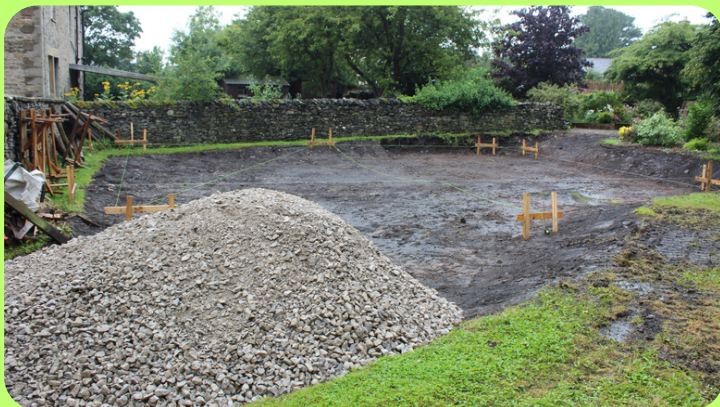
Stone for the path arrives