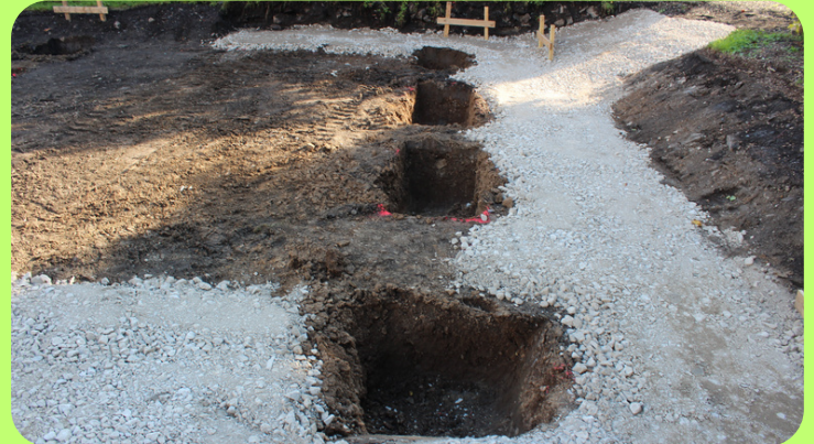
Pad holes dug and path created